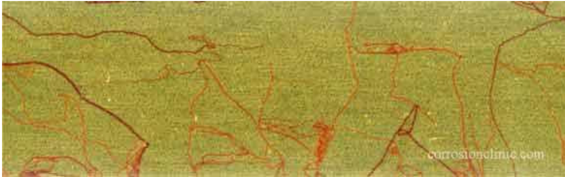
Filiform corrosion of a tin-coated steel

What is filiform corrosion? Filiform corrosion is a special form of corrosion that occurs under some thin coatings in the form of randomly distributed threadlike filaments. Filiform corrosion is also known as Underfilm Corrosion or "filamentary corrosion".